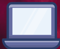
PERSONAL COMPUTERS AND HARD DRIVES