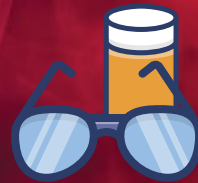
PRESCRIPTIONS AND EYEGLASSES